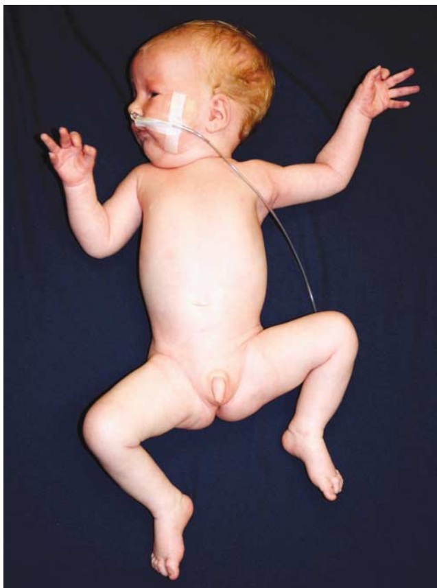
Figure 1 Hypotonia of infancy in a one-month-old male with PWS. Note frogleg position and need for a feeding tube. Also note dolichocephaly and hypoplastic, empty scrotum.

Hypotonia is prenatal in onset, and is usually manifested as decreased fetal movement, abnormal fetal position at delivery, and increased need for assisted delivery or cesarean section. In infancy (Figure 1), there is decreased movement and lethargy with decreased spontaneous arousal, weak cry, and poor reflexes, including a poor suck that leads to early feeding difficulties and poor weight gain. Deep tendon reflexes are often spared. Assisted feeding through a feeding tube and/or special nipples with increased feeding times are invariably necessary. The hypotonia is central in origin. Mild-to-moderate hypotonia persists throughout life. Hypotonia is so characteristic that all newborns with unexplained persistent hypotonia should be tested for PWS. 1,2